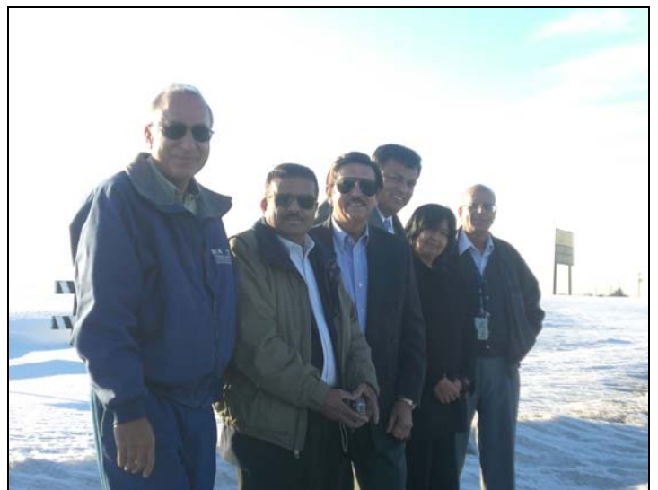
The First Steps on the Land