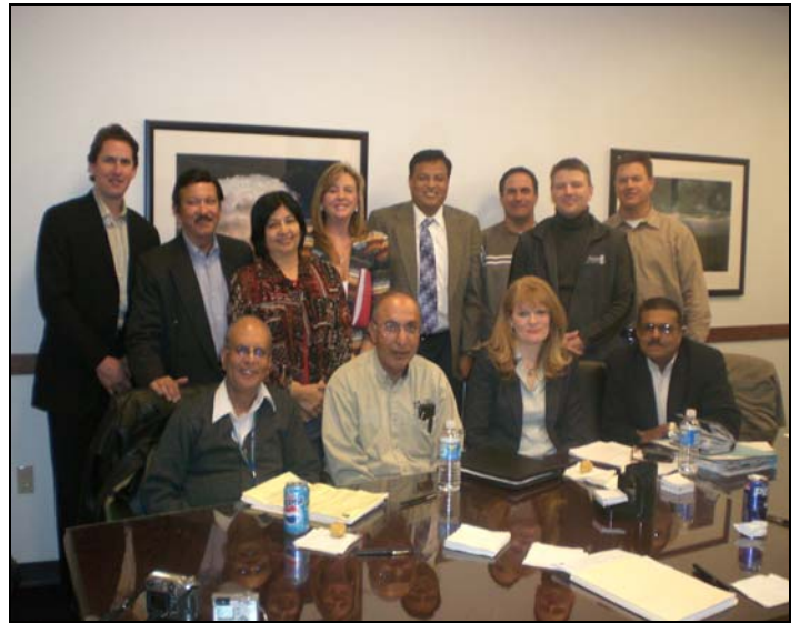
The Land Sign-up